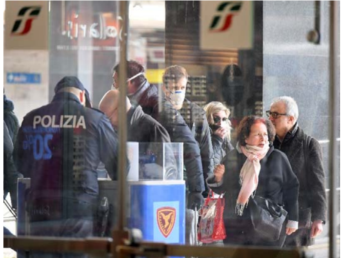
On March 10, Italy awoke to a national lockdown intended to contain the spreading COVID-19.

Italy was the first European country to be hard hit by the outbreak, and the first one to implement harsh response measures. From February 7 when the first local confirmed case was reported, to February 22 when a sudden surge in confirmed cases occurred, Italy's response was based on the perception that COVID-19 was more or less a severe flu. Although it took action, Italy's signals were not clear and its epidemic control measures were relatively lax. People lacked