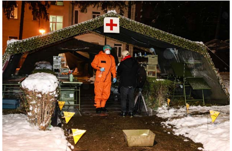
The base of China's anti-epidemic expert team to Serbia.

Chinese and Irish medical experts held a special video conference on COVID-19, during which Chinese experts answered questions from their Irish counterparts on epidemic control and treatment of patients, and shared experience in preventing community transmission, home quarantine policies, control and interruption of transmission routes, early detection and