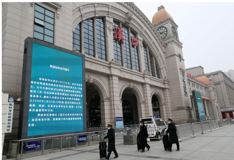
On January 23, Wuhan was locked down to contain the outbreak of COVID-19.

the country, took quick and coordinated actions in response to the outbreak. Following the lockdown in Wuhan and Hubei province, strict control measures were enforced in the rest of China. At the national level, the Central Leading Group on Responding to the Novel Coronavirus Pneumonia