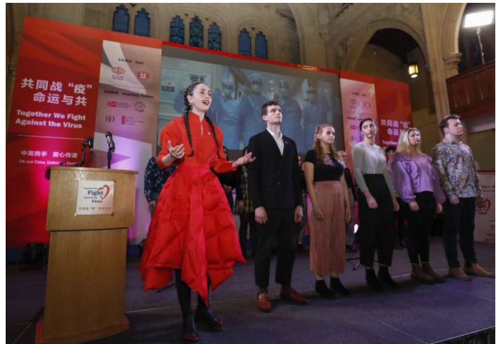
“Together We Fight against the Virus- UK and China, United We Stand” event jointly hosted by the City of London and Chinese and British Business Communities.